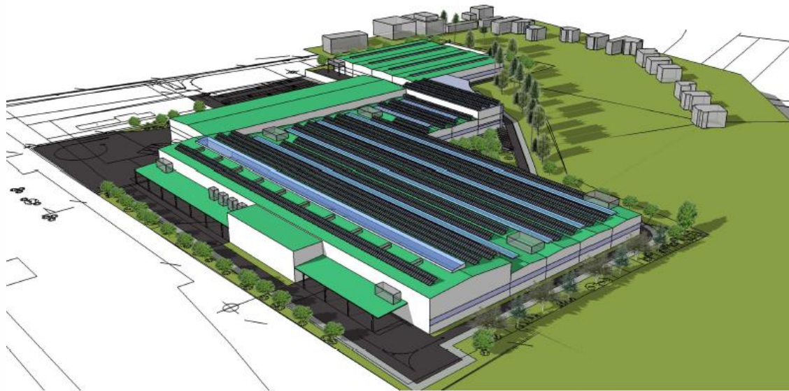
Model - pohled jižní